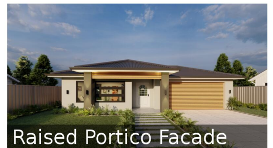
Raised Portico Facade